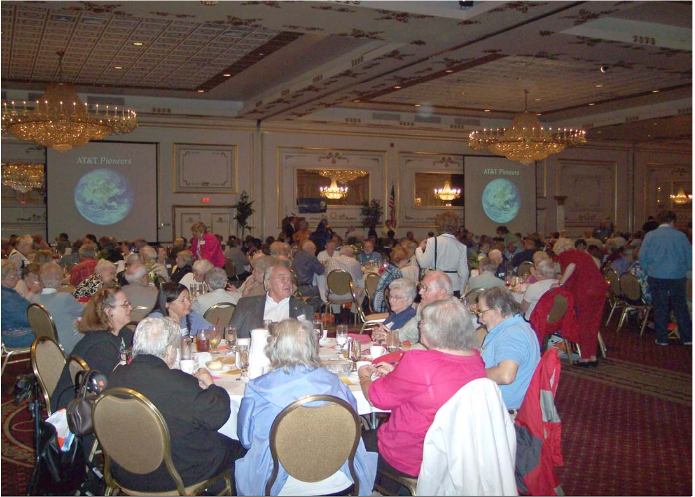
A good meal with old friends in an elegant setting. A great way to spend the day.